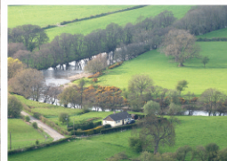
River Elan from Cargafallt The River Elan meets its rendezvous with the River Wye below this lofty perch.