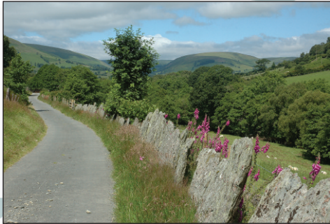
Stone wall near Safn y Coed Farm