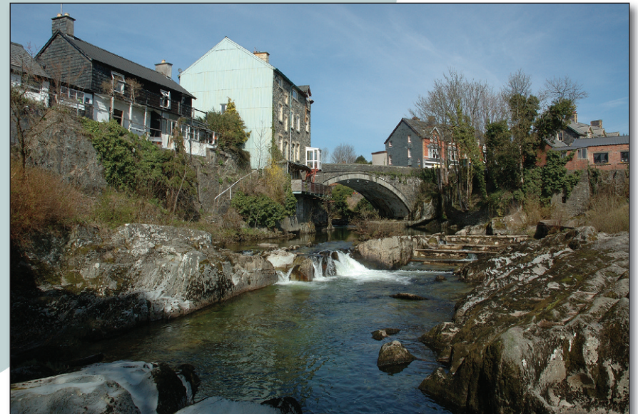
River Wye at Rhayader