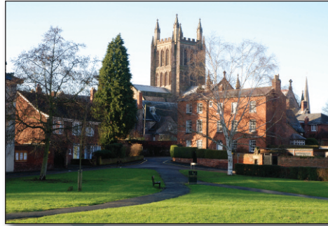
Hereford Cathedral from Castle Green