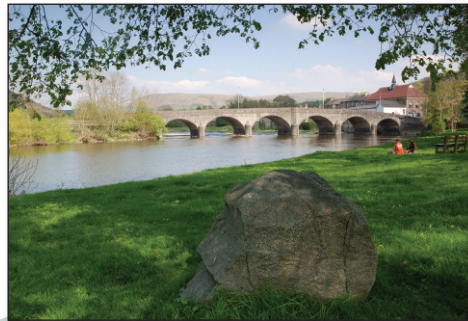
River Wye at Builth Wells