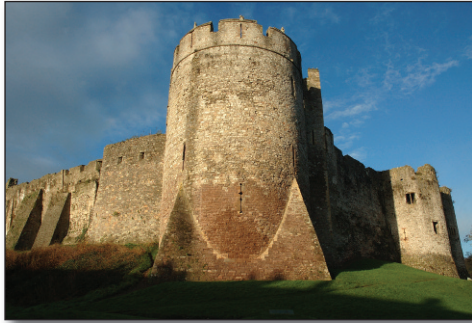
Classic Chepstow Castle