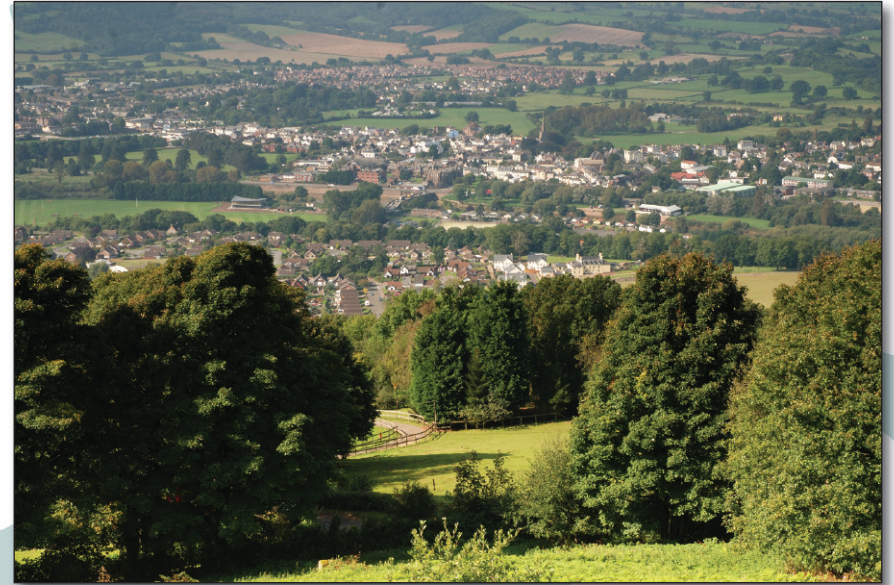
Monmouth overlook from Kymin Tower